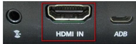
HDMI IN port on XMP-6400