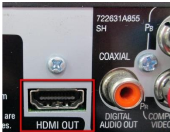
HDMI OUT port on AV source